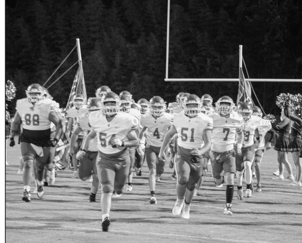
The Indians take the field in their road white uniforms at Anderson, SC.

annual awards banquet hosted by the Angry Chicken restaurant will be Oc-